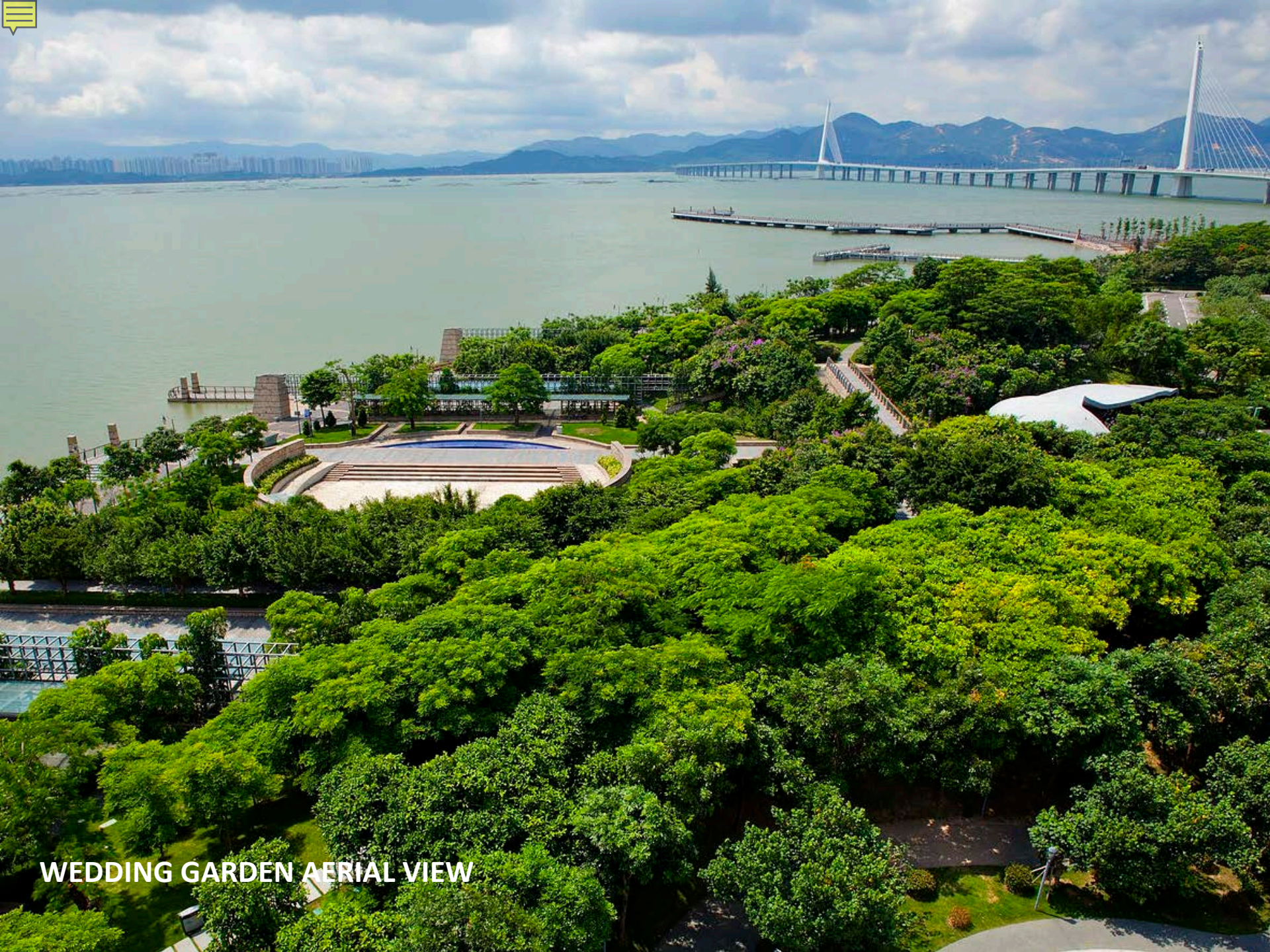
WEDDING GARDEN AERIAL VIEW