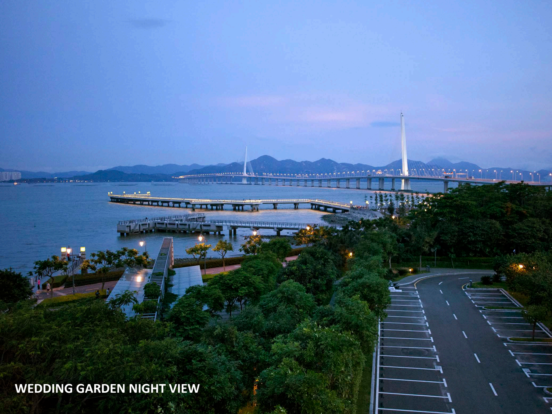
WEDDING GARDEN NIGHT VIEW